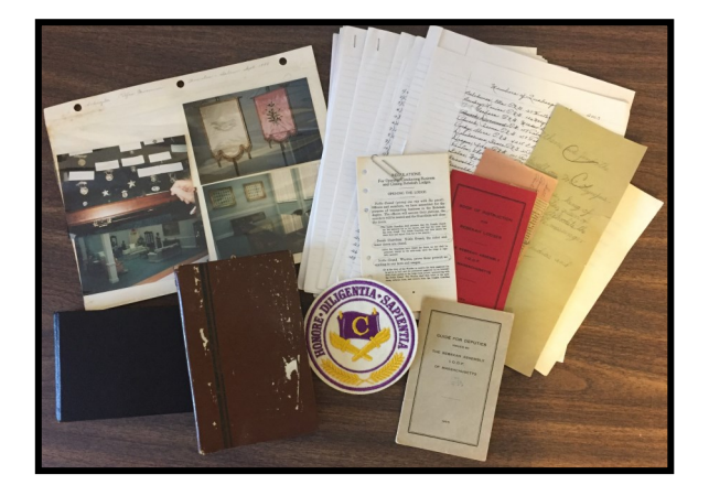
Miscellaneous Rebekah Lodge paperwork and photographs Donation from Monson resident