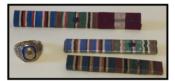
Monson Academy Class Ring World War II Bar Pins Donation from Brimfield resident