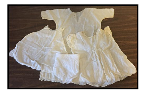
Antique baby clothes Donation from Wilbraham resident