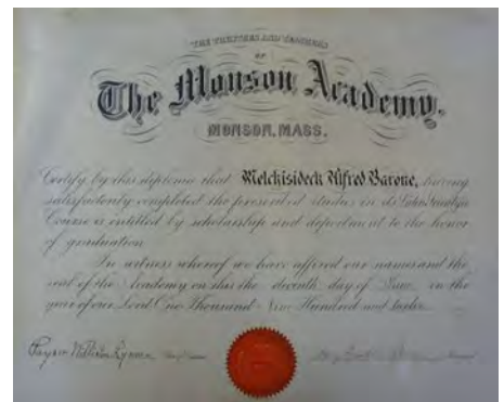
1912 Monson Academy diploma