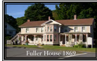
Fuller House 1869