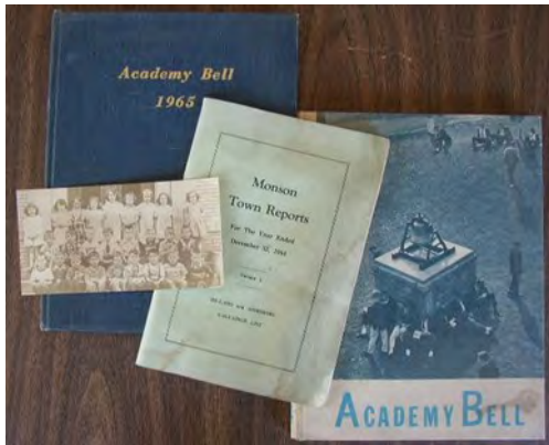
Monson Academy Yearbooks, 1944 Town Report, Class photo South Main Street School