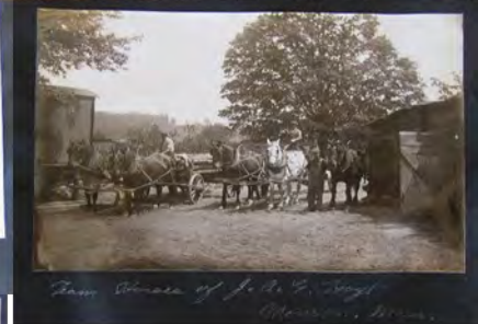
1913 Photograph Album with photos of temporary lumber mill located on Bunyan Road