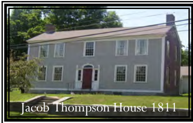
Jacob Thompson House 1811