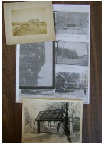
Black & white photos of trolley bridge near Bunyan Road, Flynt Quarry Railroad bridge near Chestnut Street, etc.