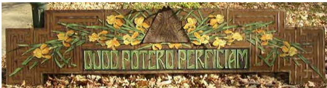
Handmade wooden, cloth and paper Banner from Monson Academy Class of 1921