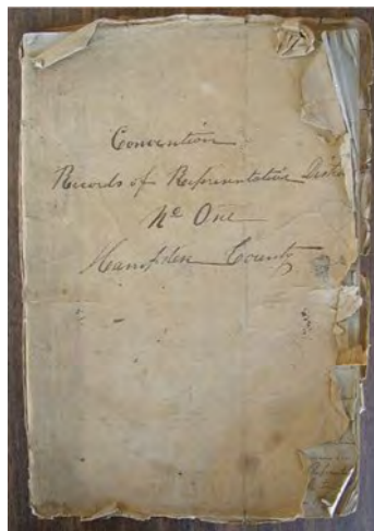
Convention Records of Representative District No. 1 Hampden County 1866-