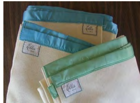
3 Ellis Mills wool blankets