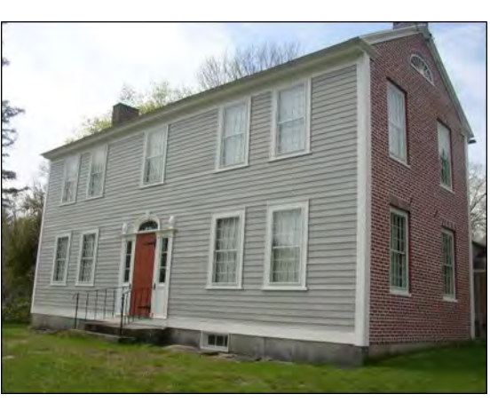
Jacob Thompson House 2016

into the otherwise pitch black attic space. Both of these windows are directly in front of the chimneys.