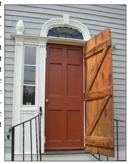
Original Front Door and Surround

80's. The back ell sills were rotted and sagging.