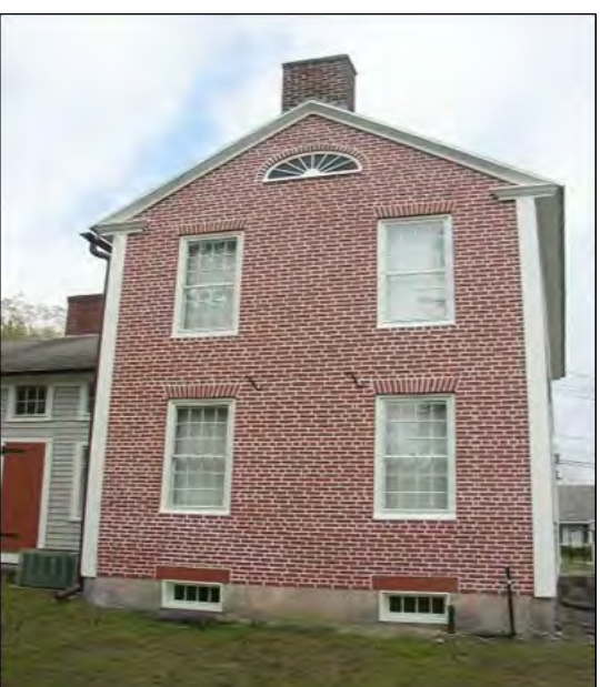
South brick end