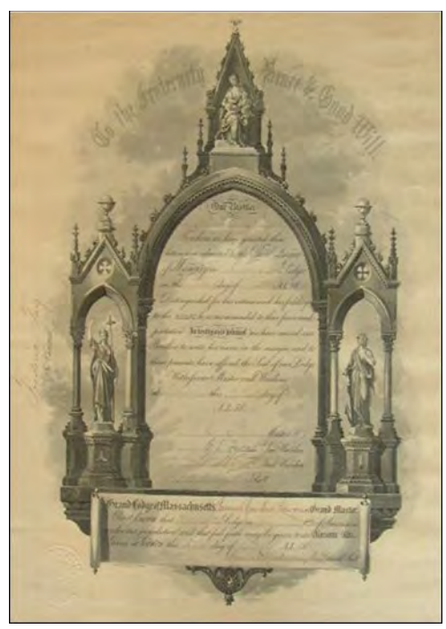
Day Spring Lodge Third Degree of Masonry Certificate 1883 (donated by Wilbraham resident)