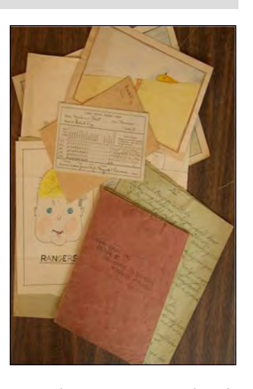
Mechanic Street School 6<sup>th</sup> Grade School Papers and Report Card around 1933 (donated by Wilbraham resident)