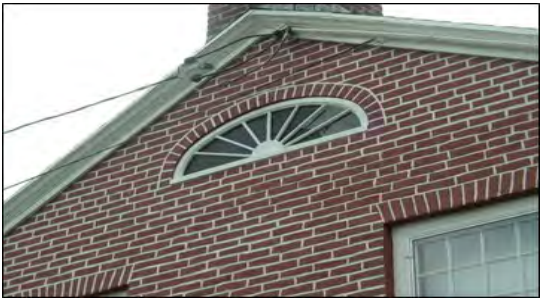
North end showing partial glass fan light window

The exterior of the home has some interesting features also. The most obvious are the brick ends which is very uncommon in this area and I believe they were used as a sort of heat storage in the winter. With a fire in every fireplace, the bulk of the wall behind would radiate heat long after the fires died down. Another heat saving device which we only discovered when removing some of the clapboards for the front porch project was the presence of long strips of birch bark tacked over the spaces in the sheathing to stop air infiltration, a sort of early American house wrap. The fan light window in the attic on the southern side of the house is totally fake and only there for appearance, but the one on the northern side is interesting in that it has a small portion of glass in the corner actually letting light