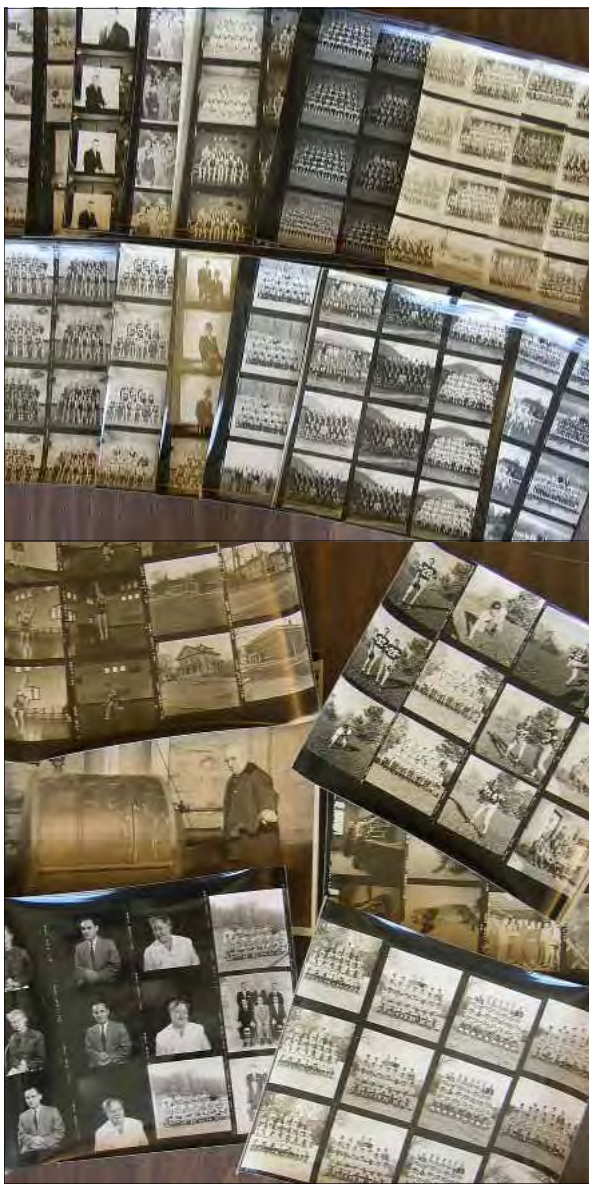
Monson Academy photos proof sheets