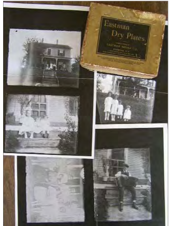
Glass negatives of Monson (?)