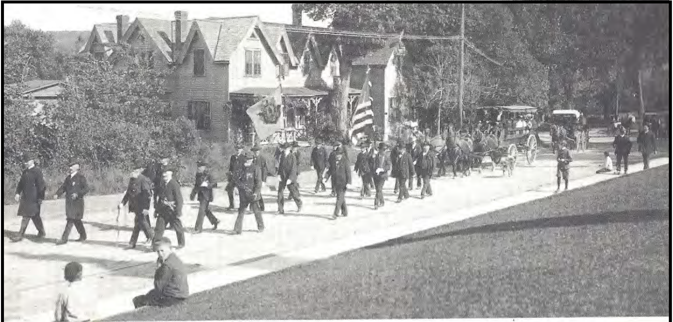
G.A.R. On The March, Decoration Day, 1906

trusting that they may in the future as in the past remember the little green mounds that cover the past members of the G.A.R.