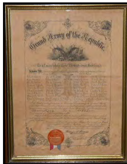
Original Charter of the Monson G.A.R.