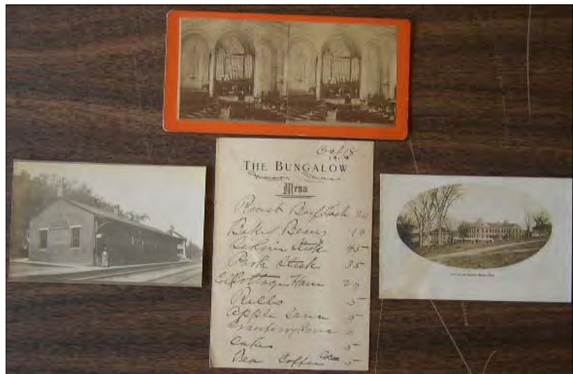
Top: Stereoview of Interior of Congregational Church; Left: Postcard of Washington Street Train Station; Middle: Menu from The Bungalow; Right: Postcard of Epileptic Hospital Monson, Mass.