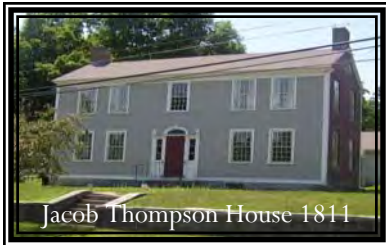
Jacob Thompson House 1811