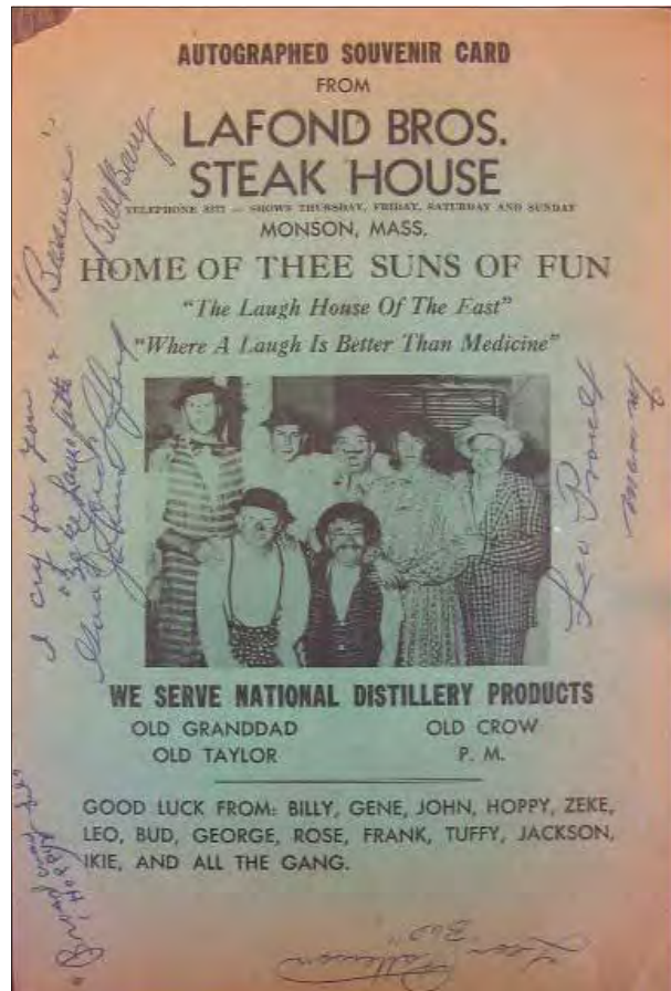
Lafond Brothers Steak House Autographed Souvenir Card