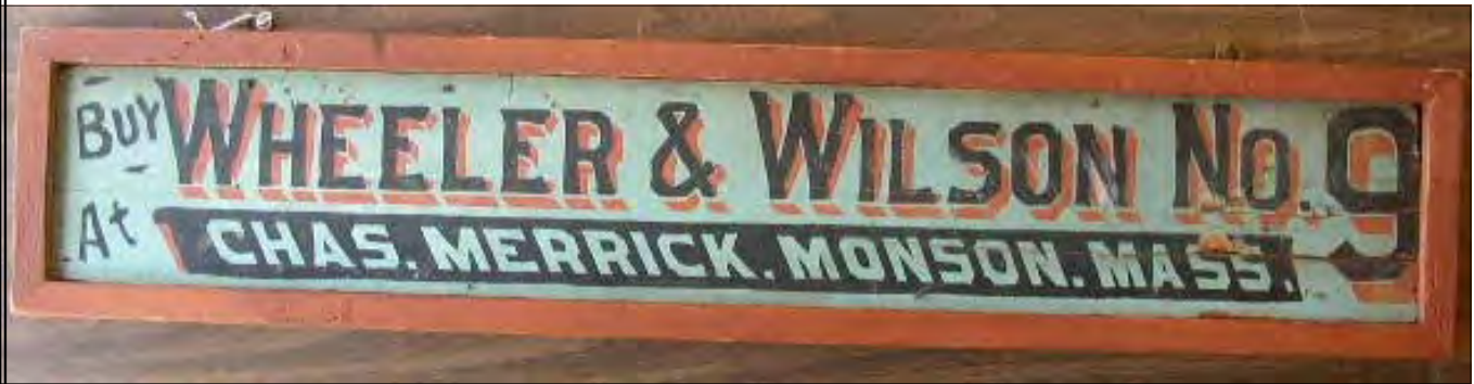
Wooden Sign from Charles Merrick Pump Organ and Sewing Machine Store