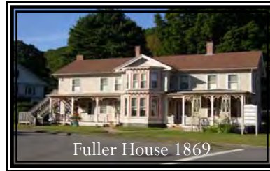
Fuller House 1869